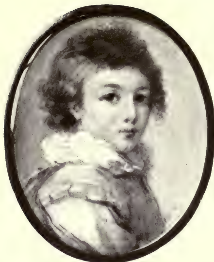
PORTRAIT OF A BOY (NAME UNKNOWN) BY JEAN HONORÉ FRAGONARD